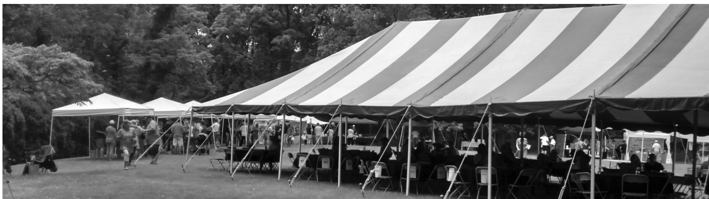
Over 400 people enjoyed our first Wine & Jazz Festival