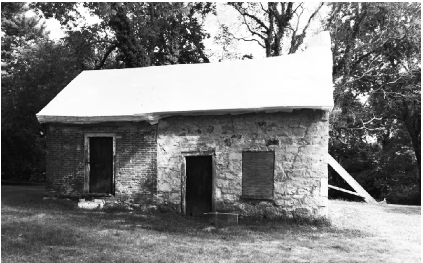
A new protective Shrink Wrap from Belfor, an international property restoration company, protects the roof of the smokehouse/kitchen