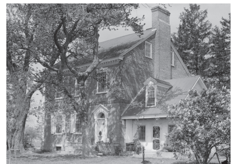
Mordington House in Kent County, Delaware