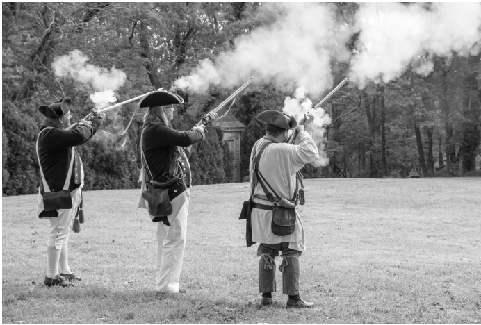
Members of the Society Sons of the American Revolution fire a musket salute to Charles Washington