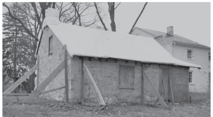
Supports brace the walls of the kitchen

The main issue for the stone kitchen is its lack of a foundation. When it was built in the 1830/1840s, the stone walls were laid directly in the ground without a proper footing. As a result, major