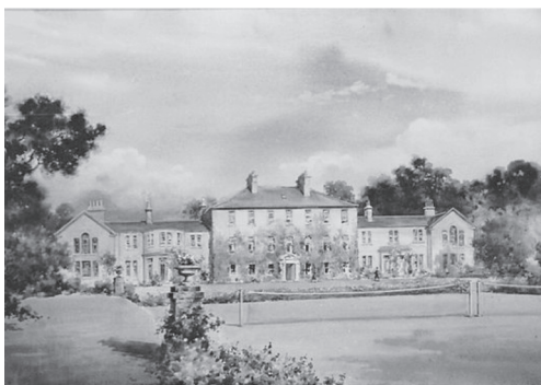
Mordington House in Berwickshire, Scotland