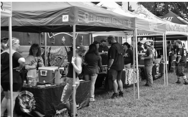
Beer Drinkers Enjoying the Craft Beer & Music Festival

Beer drinkers braved less than perfect weather to enjoy our third annual Craft Beer & Music Festival on September 9. Thanks to the over 100 volunteers who came out to make the day a success! Special thanks to Josh Vance of Abolitionist Ale Works, in Charles Town, for booking another great line-up of bands and drawing over 30 craft brewers to showcase 100+ beers. We are already looking forward to next year's festival.