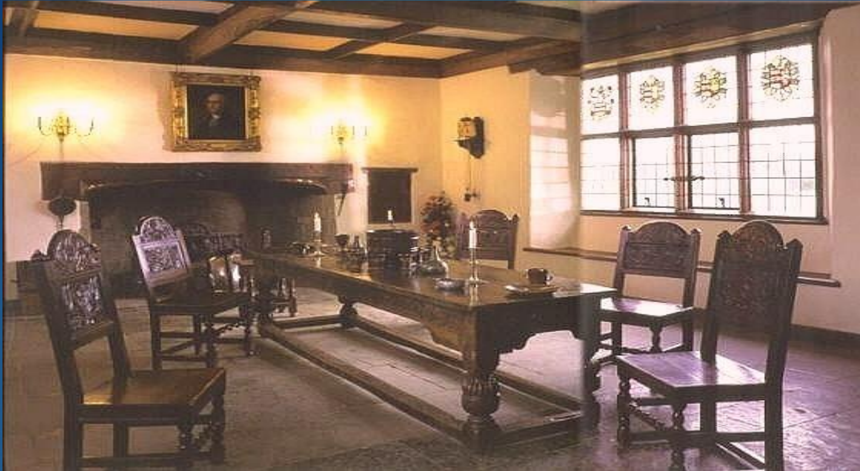
Sulgrave Manor Great Room,

Notice the portrait of General Washington place of honor in the Great Room