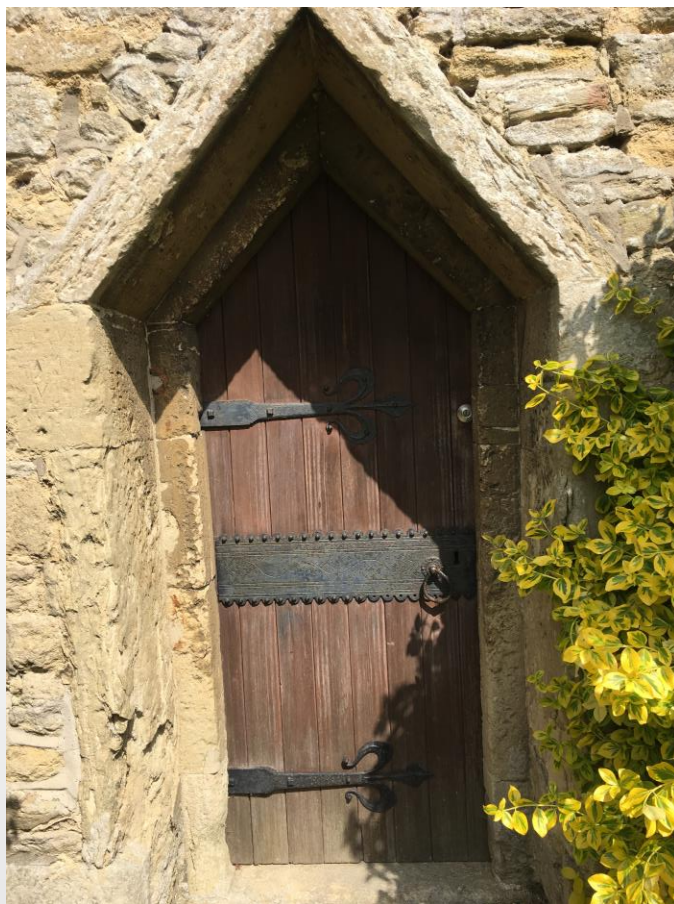
The West Door-Saxon Style