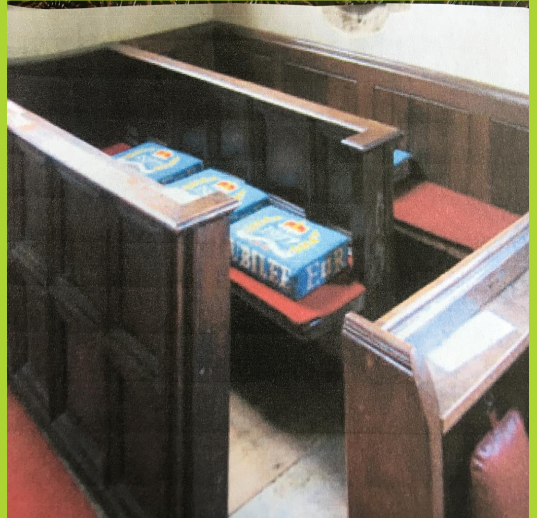
The Washington pew near the stained glass window.