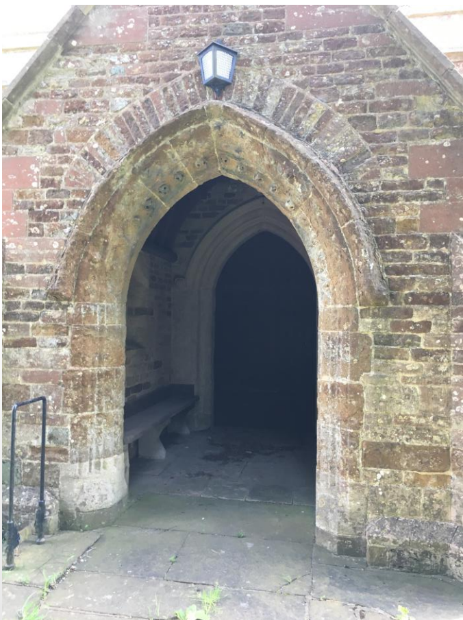
The North Door 14 th Century