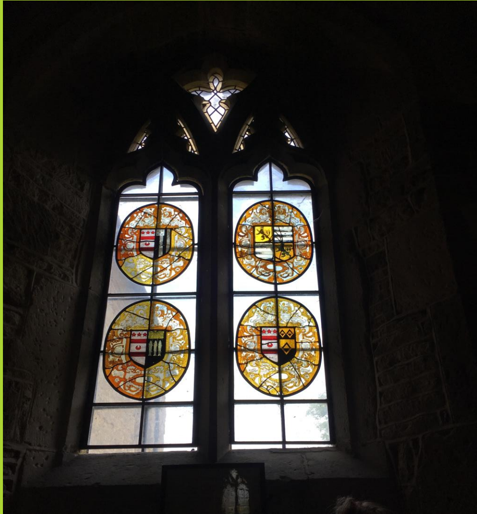
The Washington Crest stained glass window