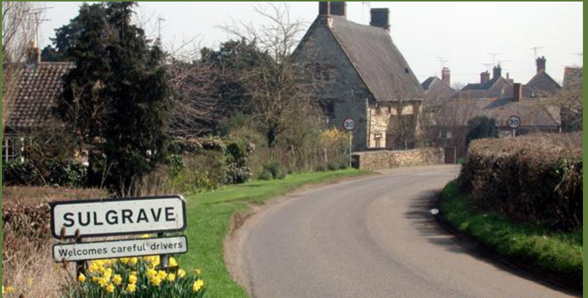
The village of Sulgrave, County of Northamptonshire