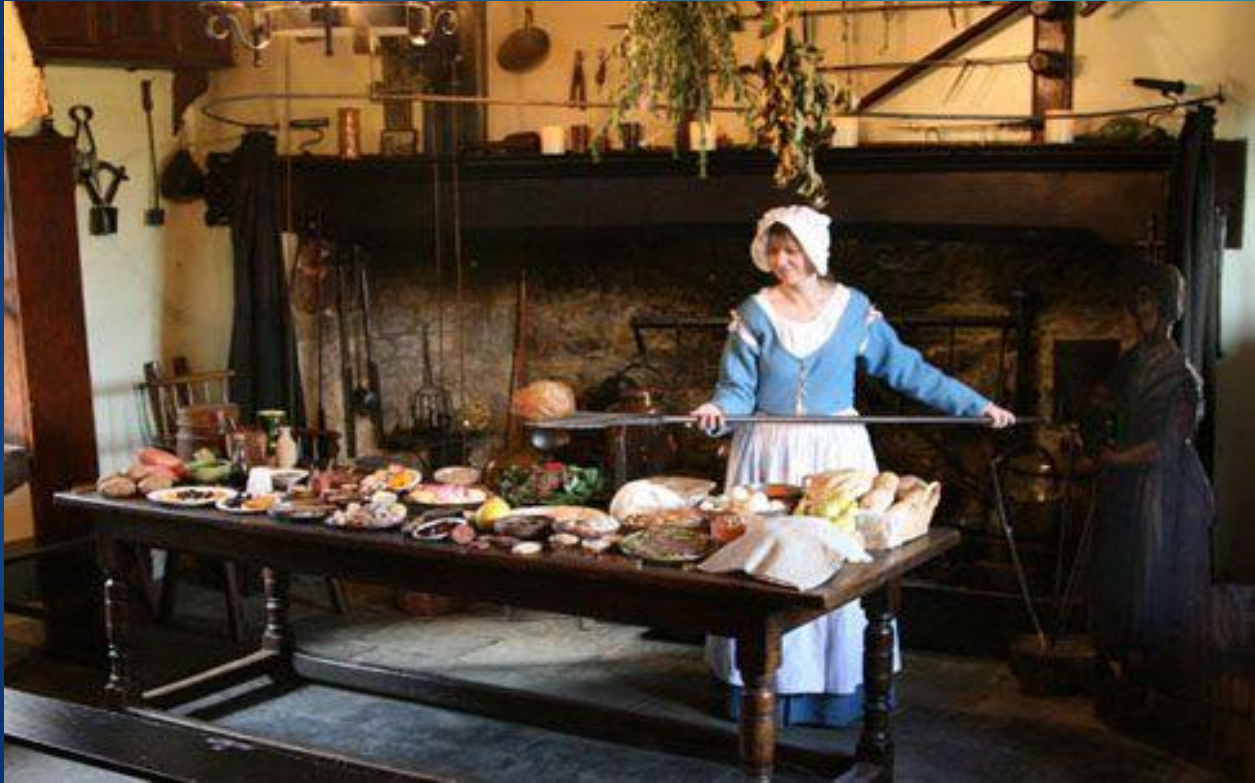
Sulgrave Manor kitchen area.